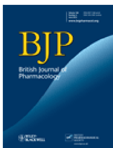
Br. J. of Pharmacology